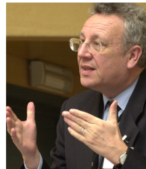
Philippe Busquin

On 15 March 1999, a few weeks before the entry into force of the Treaty of Amsterdam, the Santer Commission resigned in scandal – including fraud allegations against the science commissioner, Edith Cresson. The next Commission embarked on a process of reform that, blessed by the happy chance that the old Commission headquarters building was closed to remove asbestos, saw the commissioners sharing offices with their own civil servants, rather than sequestered with political aides. Named to the research portfolio was another influential Belgian politician and former MEP, Philippe Busquin, who made a point of professing his personal interest in science and embarked on a project of creating a "European Research Area" – the equivalent of the Single Market for the world of science and technology. The Commission then published a communication, "Towards a European Research Area" (COM(2000)0006 final), in which it argued that a Community effort must help structure European research: