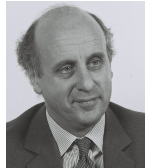
Étienne Davignon

In 1977, the Commission upped its ambition with a plan for a "Common Policy in the Field of Science and Technology" (COM(77)283) that argued it was time for a solid legal and operational "framework". The Council bought part of the plan, but not all.