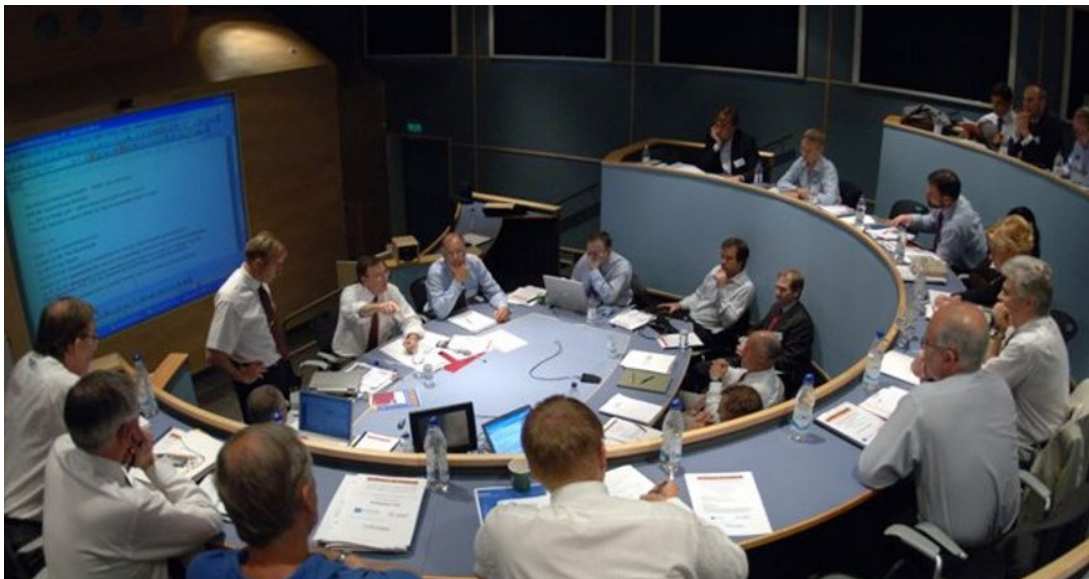
13 June 2006: Stockholm Biotech Roundtable

Over time, its activities broadened to include special, multi-year communications projects with its members and the wider European R&D community, including: