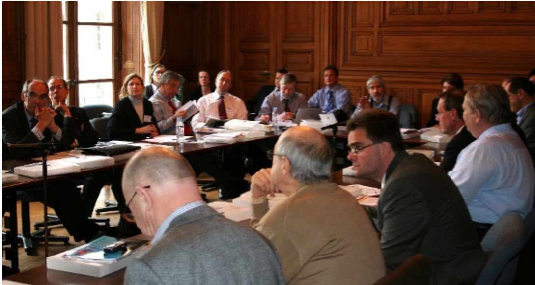
7 March 2006: First Science|Business roundtable – École des Mines, Paris

So, a new strategy. First, switch from print to the emerging online publishing sector, to lower costs and broaden audience. Second, engage that audience with a membership organisation of universities and companies that needed help finding new partners and funders across borders and sectors.