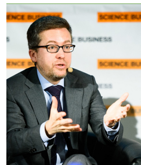
Carlos Moedas, at Science|Business conference 16 February 2016