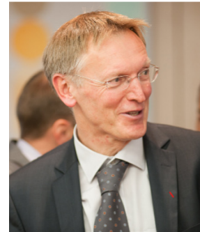
Janez Potočnik, at Science|Business conference 26 September 2012

In November 2004 Janez Potočnik, a Slovenian economist and politician, succeeded Busquin as research commissioner. Having led negotiations of the accession of Slovenia to the EU, he was very aware of budget issues and the need to convince finance ministers of the value of R&D programmes. He enlisted economic advisors, and pushed for more econometric support for policy. He advocated for recognition of a “5th Freedom” – of ideas – in the EU. And he called his proposal for the 7th Framework Programme (COM(2005) 118 final) “Building the ERA of knowledge for growth”. It emphasised research themes rather than legal instruments, formally established the European Research Council for frontier research, and sought a doubling of the research budget over a seven-year period (2007-2013) that would coordinate it with the Commission’s overall budgeting mechanism, the Multiannual Financial Framework. He ended up with €51 billion, 30% less than requested, but still a huge increase marking the first time the EU research budget exceeded that of the US National Science Foundation. Notably, he also clashed with then-President José Manuel Barroso who wanted to create what he called “an MIT of Europe”, the European Institute of Innovation and Technology. Barroso won the fight.