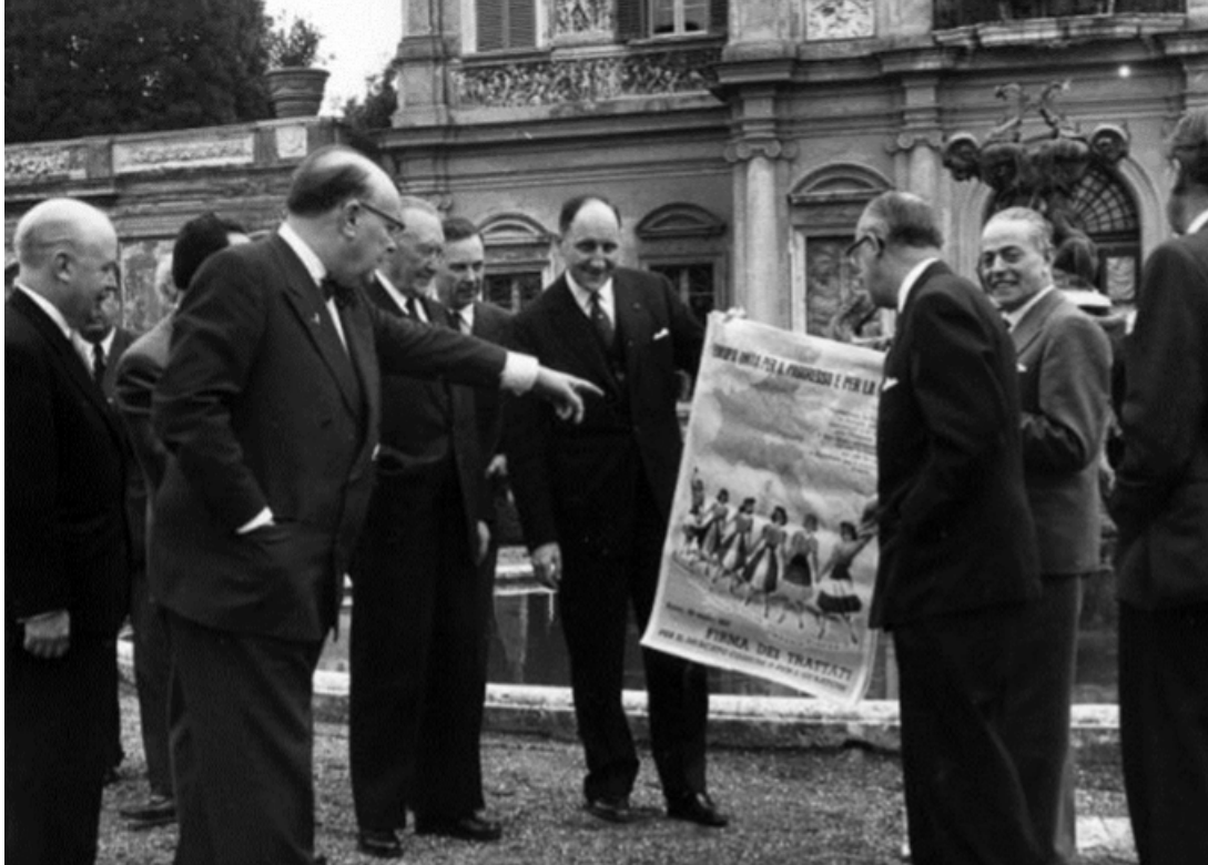
1957: European leaders admiring a poster promoting their signing of the Treaty of Rome.

After the horrors of World War II and its cataclysmic conclusion in the Manhattan Project, the importance of science was clear to all politicians. But the idea of pan-European cooperation for it only gradually emerged. An early step came in 1951, when European leaders began planning what would become the CERN physics lab in Geneva, and included some provisions for technical and economic research in the founding treaty for the European Coal and Steel Community, precursor to what is now the European Union. In 1957, they enlarged the scope for research to include agriculture in the Treaty of Rome, and began the first real attempt at scientific collaboration in the Euratom Treaty. But it was not easy. Germany and France launched national programmes in nuclear energy, competing with each other and against the European programme for budget, infrastructure and prestige.